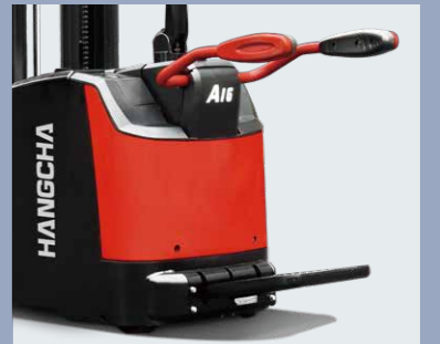
The integrated stamping molded guardrail offers better protection for the operator