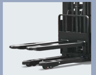
Tandem load wheel