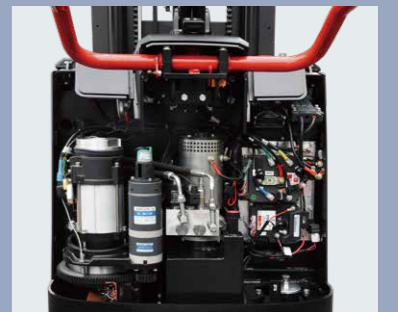
Back cover can be opened fully, and all components and parts are clear at a glance, which is very convenient for maintenance of the entire machine